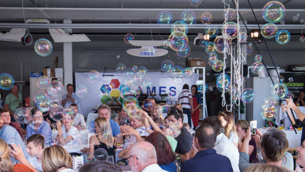
On 13th of September 2019 we celebrated these milestones in our AMES-history together with our AMES team, family and friends.